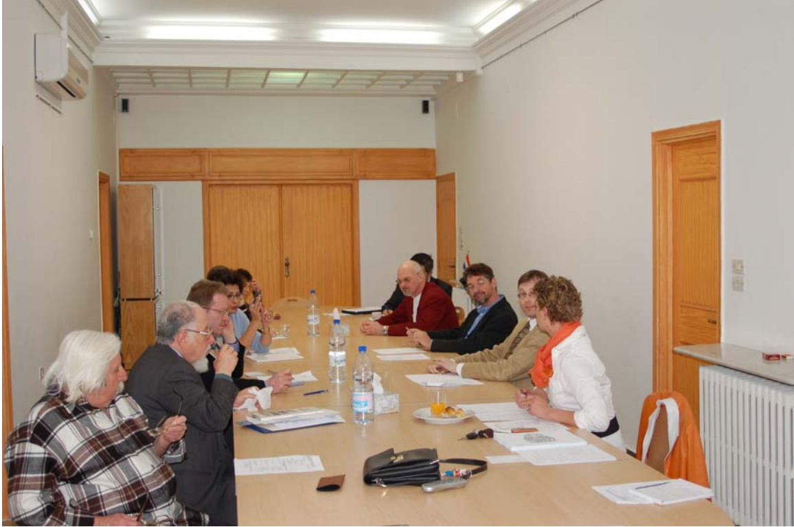
Picture taken during the Brain Storm Sessions on 6/3/07