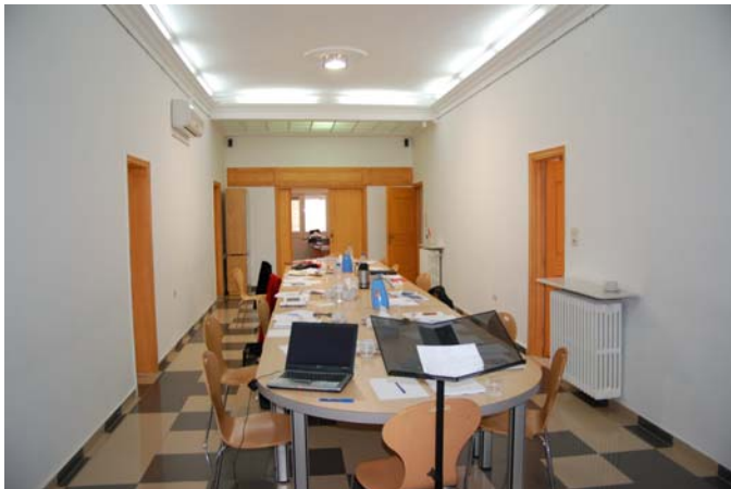
The central NIASD room during a break, 5/3/07