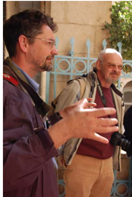
At the monastery at Sahnaya (above and right), 7/3/07