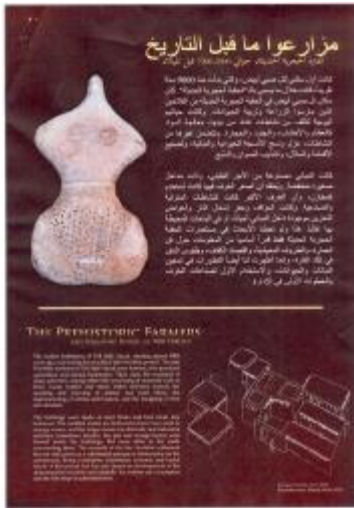
Arabic translation of English texts for the museum in Raqqa (May-June 2010)