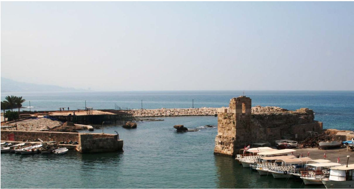
Harbour at Jbeil – Byblos

During this summer course, Jbeil will be the basis from which we will explore Christian and Islamic art and architecture in the region